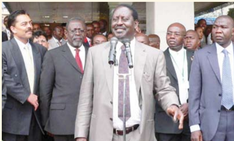
The Rt. Hon. Prime Minister at a previous KEPSA Round table

The Media Council of Kenya is an independent national institution established by the Media Act, 2007 as the leading institution in the regulation of media and in the conduct and discipline